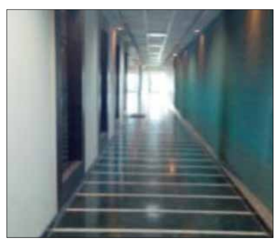
4th Floor corridor